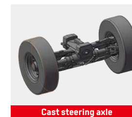
Cast steering axle

The steering axle is installed with rubber pad, which effectively improve the operation comfort and reliability.